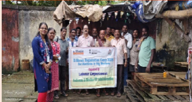
'Awareness-cum-Spot Registration Campaign' organized by Labour Deptt. for registering unorganized workers

Section 2 (d): "building or other construction work" means the construction, alteration, repairs, maintenance or demolition of or, in relation to, buildings, streets roads, railways, tramway, airfields, irrigation, drainage, embankment and navigation works, flood control works (including storm water drainage works), generation, transmission and distribution of water), oil and gas installation, electric lines, wireless, radio, television, telephone, telegraph and overseas communications, dams, canals, reservoirs, watercourses, tunnels, bridges, viaducts, aqueducts, pipelines, towers, cooling towers, transmission towers and such other work as may be specified in this behalf by the appropriate Government, by notification but does not include any building and other construction work to which the provisions of the Factories Act, 1948 (63 of 1948), or in the Mines Act, 1952 (35 of 1952) apply.